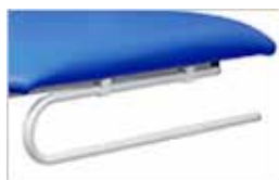
Paper roll holder - included

Order online at meditelle.co.uk or email sales@meditelle.co.uk